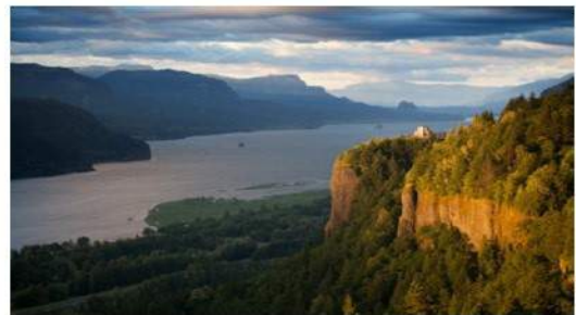
Columbia River, WA State

Submitted by Allen D., Panel 68 Delegate